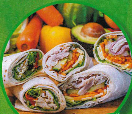
Artisan Tortilla Wraps